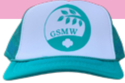
GSMW Spring Hat — $12

Steminist T-Shirts & GSMW Spring Hats! Call the Billings shop to order or email shop@gsmw.org