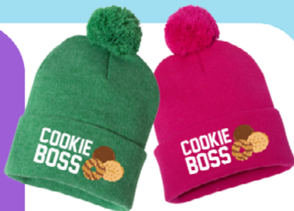
Cookie Boss Beanie