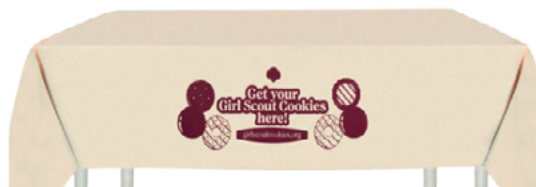
Cookie Booth Table Cloth - 72" x 108"