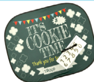
Twist & Fold Sign