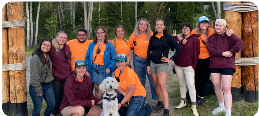
▶ Pictured: 2023 GSMW Summer Camp Staff

Girls who sell 1,200 packages of cookies can select the $350 camp credit, redeemable only by the Cookie Earner. Girl Scouts that qualify will be notified by email prior to registration.