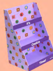
Cookie Riser $35 | Display multiple cookie boxes