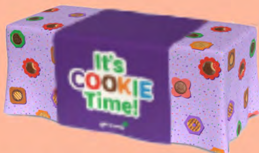
Cookie Time Table Runner $15 | Tablecloth sold separately