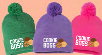
Cookie Beanie $18 | Stay warm this cookie season