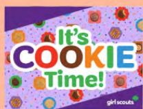
Yard Sign $15 | Extra shipping rates apply