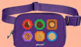
Cookie Belt Bag $15 | Adjustable Belt Bag