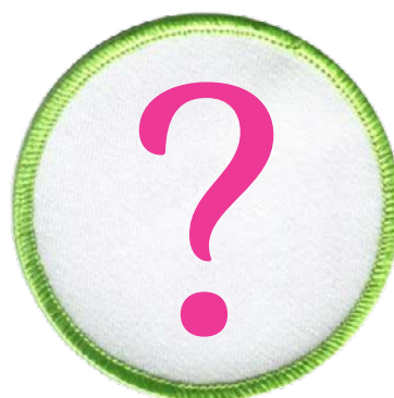
Girl Designed Spring Renewal Patch!

↖ Create Chia Seed Windchimes and Wildflower Seed Bomb Paper!