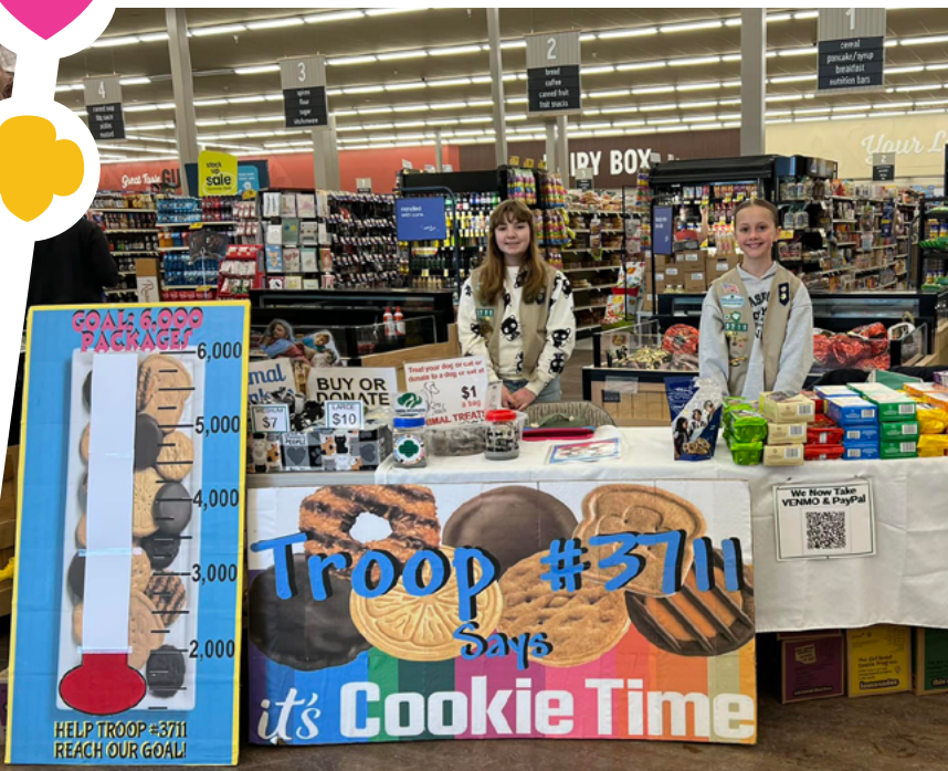
▶ Troop 3711 | Cookie Booth | #2024gsmwbling