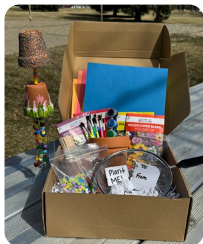
Exclusive Spring Activity Box!

*If required leaders currently have a Lifetime Membership, they may gift their free membership to another adult in the troop.