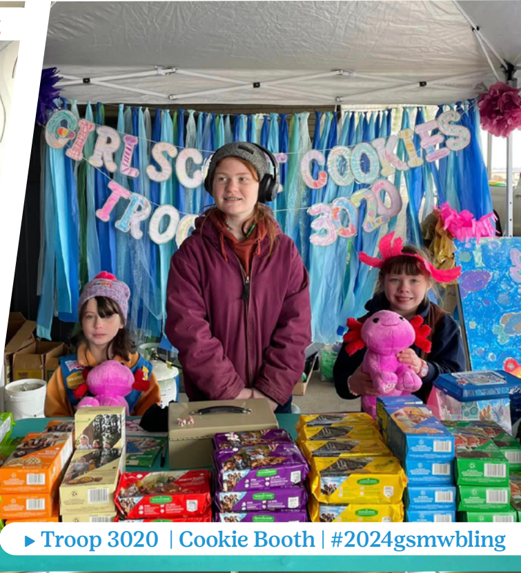
▶ Troop 3020 | Cookie Booth | #2024gsmwbling