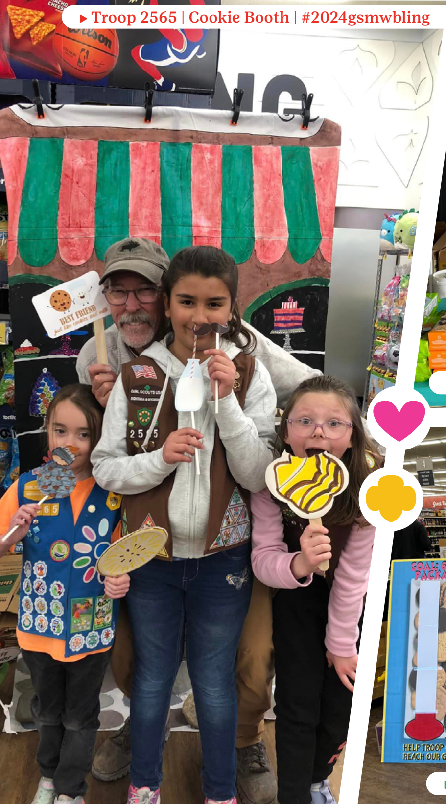
▶ Troop 2565 | Cookie Booth | #2024gsmwbling