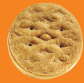
Peanut Butter Sandwich