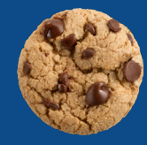
Caramel Chocolate Chip