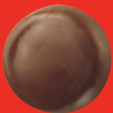
Peanut Butter Patties