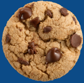
Caramel Chocolate Chip