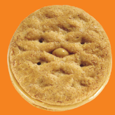
Peanut Butter Sandwich