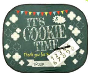
Cookie Time Twist Sign