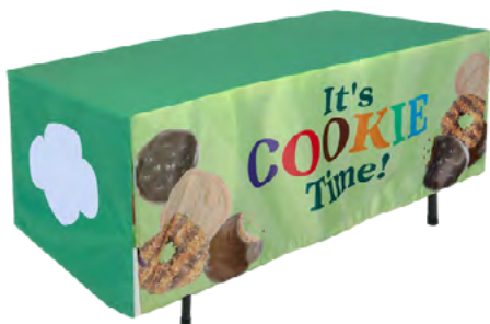
Cookie Time Tablecloth 72" x 108"