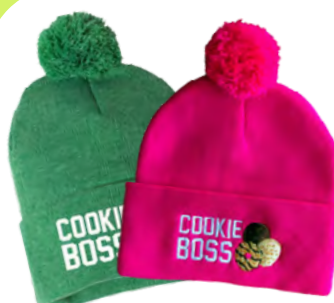
Cookie Boss Beanie