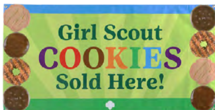
Cookie Time Banner 24" x 48"