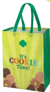
Cookie Tote Bag Reusable bag perfect for delivering cookies. Laminated plastic/polyester with web handles