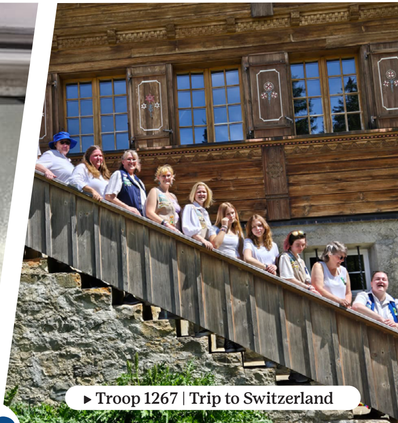
► Troop 1267 | Trip to Switzerland