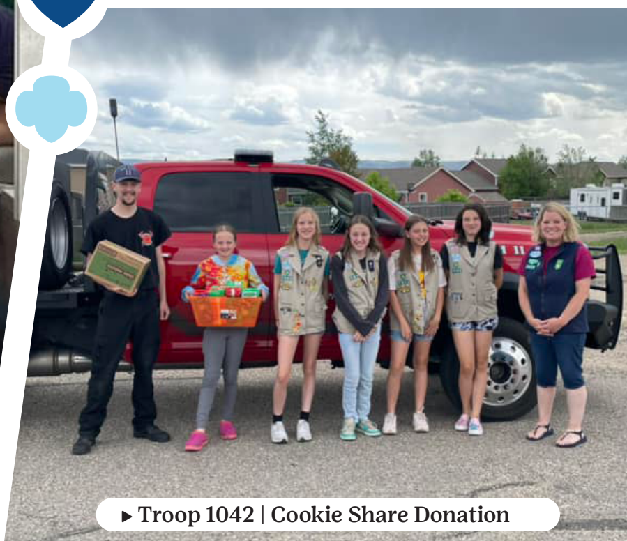
► Troop 1042 | Cookie Share Donation