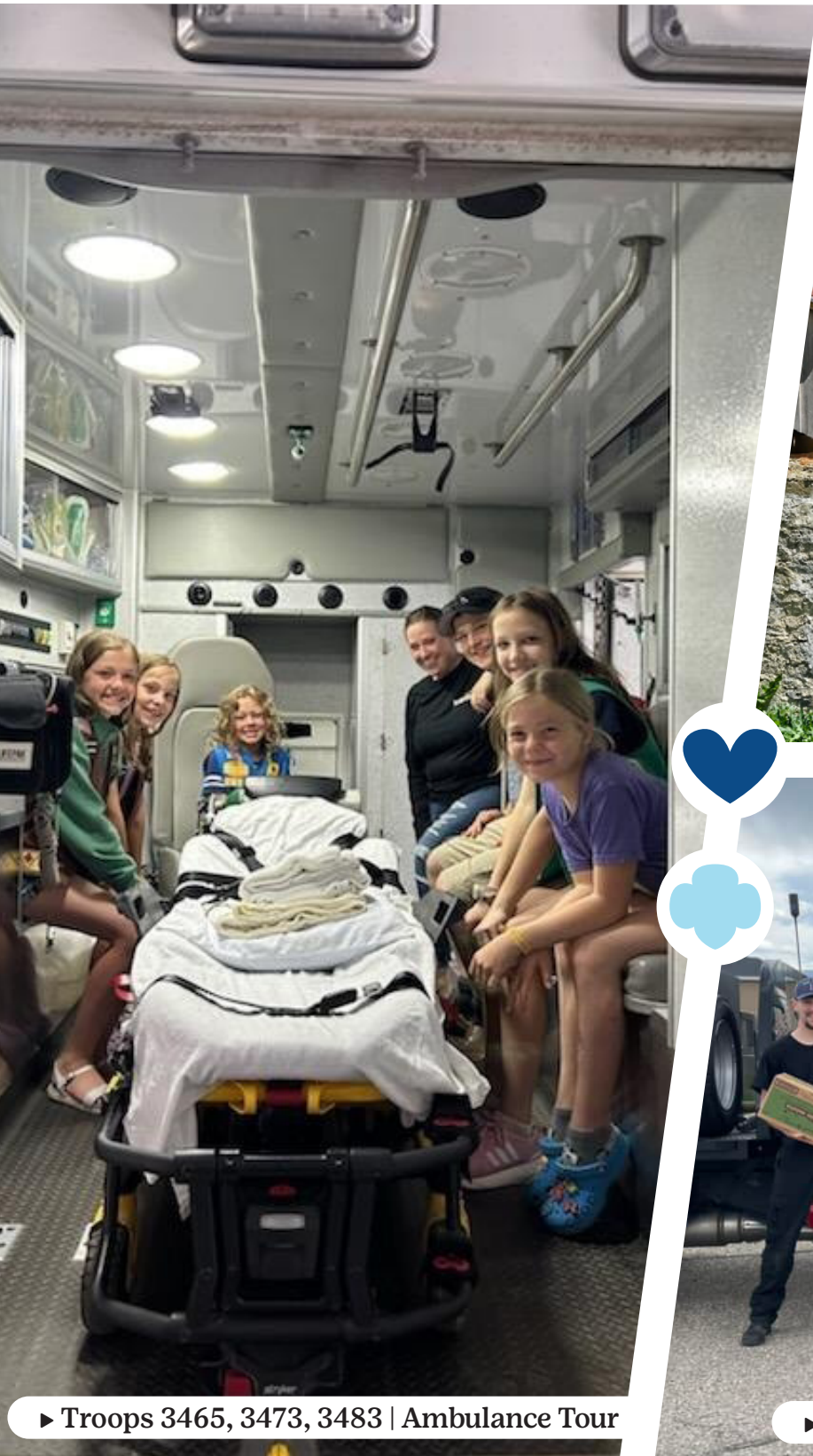
► Troops 3465, 3473, 3483 | Ambulance Tour