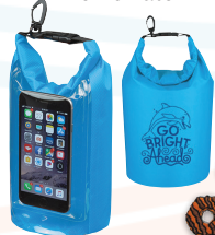
300+ Packages Dry Bag AND Cookie Sticker Patches OR $5 GS Card