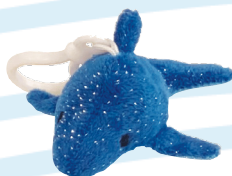
500+ Packages Clip-on Dolphin