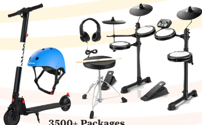
3500+ Packages Electric Scooter AND Helmet OR Electric Drum Set OR $250 GS Card