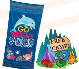
1000+ Packages Beach Towel AND Free Camp OR $200 Out of Council Camp Credit OR $50 GS Card