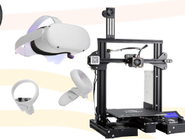
2500+ Packages VR Headset OR 3D Printer OR $150 GS Card