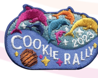
Attend Cookie Rally