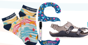
550+ Packages Socks AND Door Hanger OR $12 GS Card OR Because Shoe