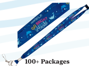
100+ Packages Lanyard