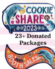
30+ Booth Packages