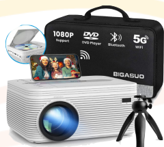
5000+ Packages Portable Movie Projector AND GoPro OR Paddleboard with Conversion Kit OR GS Phenom Pass AND 1-Day Disney Pass OR $350 GS Card