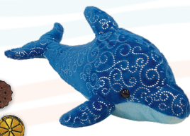
375+ Packages Dolphin Plush OR $6 GS Card