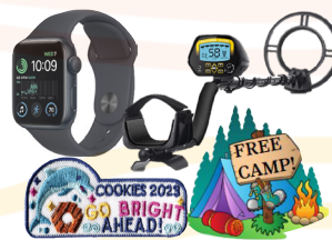
2023+ Packages 2023 Patch AND Smart Watch OR Metal Detector OR Free Camp OR $100 GS Card