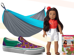
1500+ Packages Custom Vans AND Hammock OR American Girl OR $75 GS Card