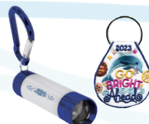
250+ Packages Mini Flashlight AND Key Ring OR $3 GS Card