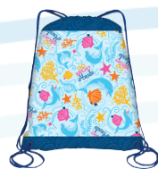
150+ Packages Drawstring Bag OR $2 GS Card