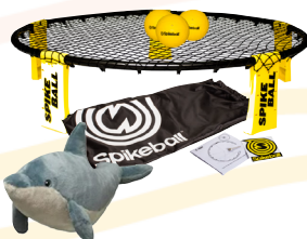
1250+ Packages Spikeball OR Adopt A Dolphin OR $50 GS Card