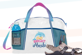
850+ Packages Sports Bag OR $20 GS Card OR Because Shoes