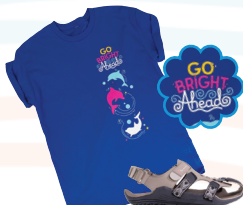
450+ Packages T-Shirt OR $10 GS Card OR Because Shoe