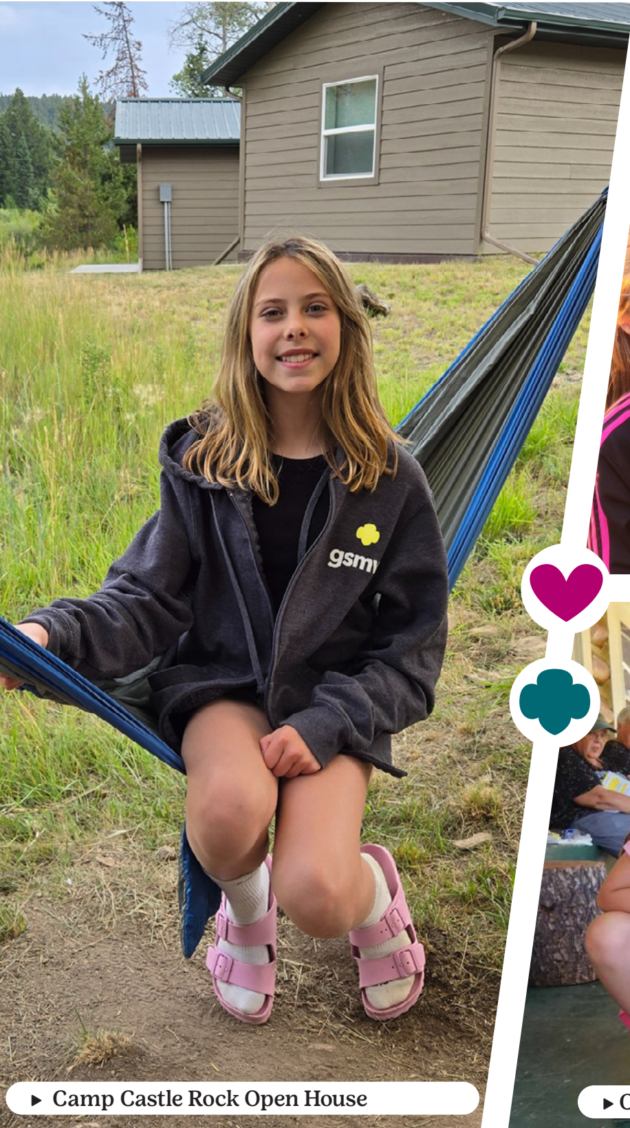
► Camp Castle Rock Open House