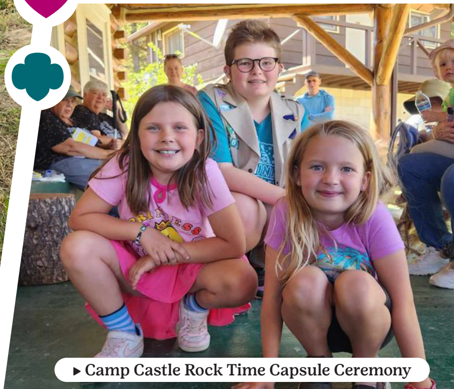
► Camp Castle Rock Time Capsule Ceremony