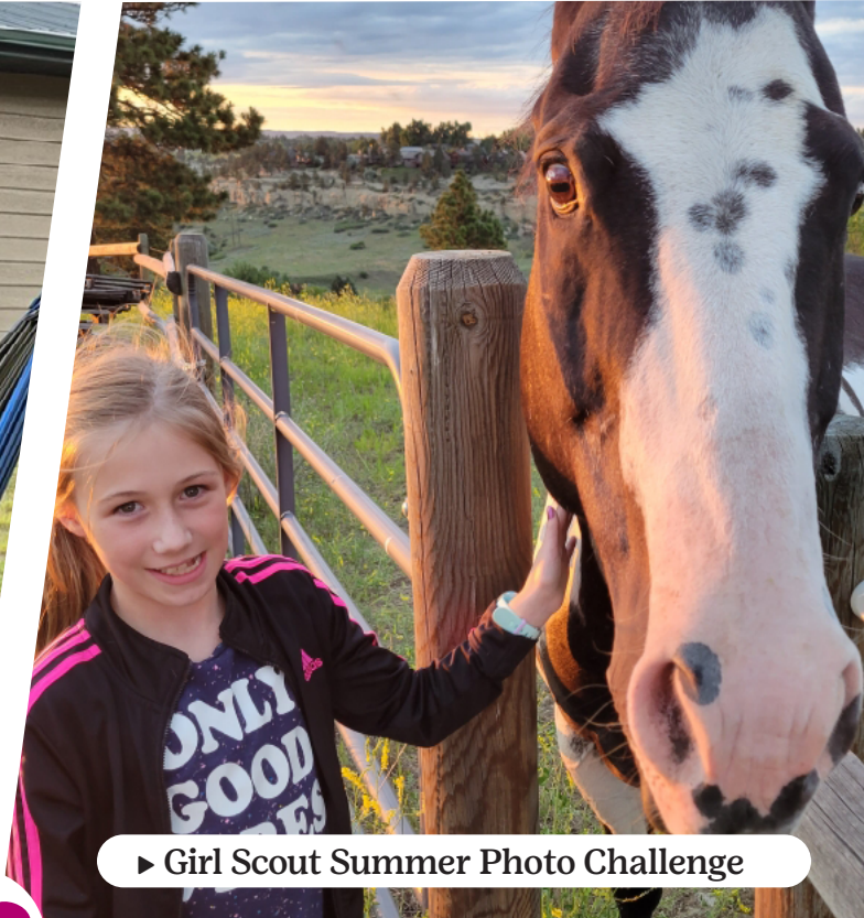
► Girl Scout Summer Photo Challenge